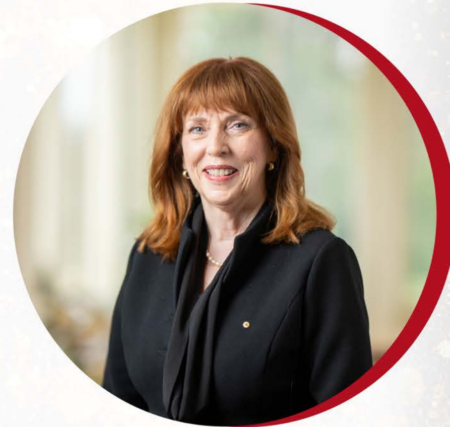
Professor the Hon. Margaret Gardner AC Governor of Victoria

Congratulations to this year's nominees and award winners. We look forward to seeing what each of you do next!